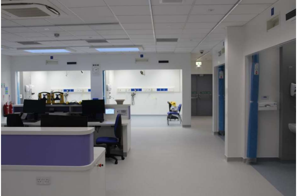
Photo: Expansion of Emergency Department

The Trust has been selected as one of the sites for a new hospital build by the government, with construction beginning in the next five years.