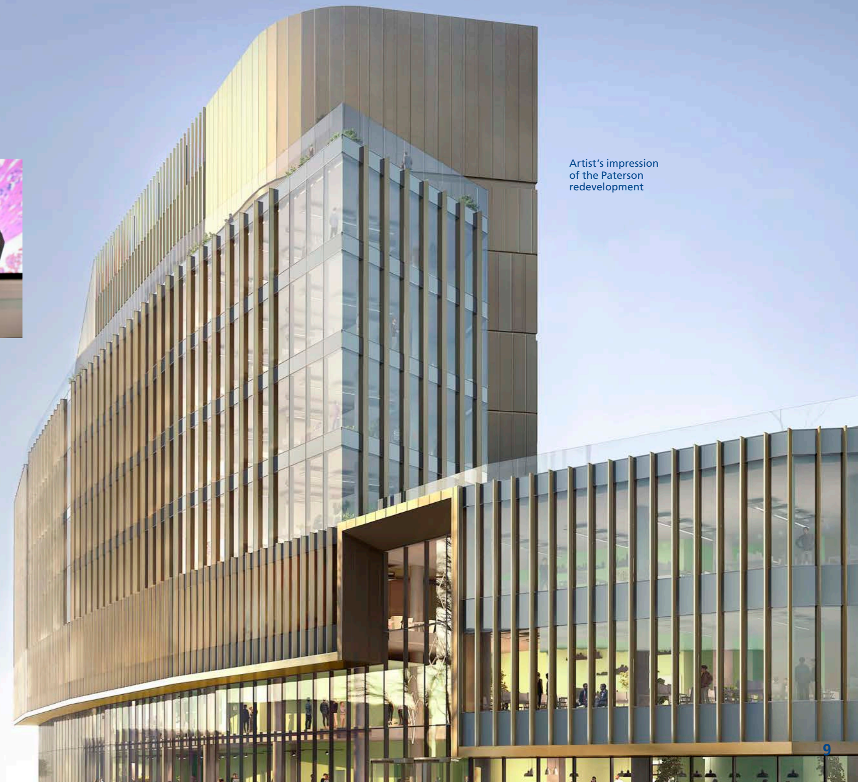
Artist's impression of the Paterson redevelopment